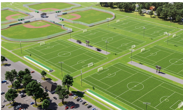
📍 Shawnee Sports Complex

The Shawnee Sports Complex: The complex has six collegiate sized artificial turf soccer fields lined for multiple sports, four collegiate size turf baseball and softball fields with movable mounds and fencing, and 27 acres of grass fields along the bank of the Kanawha River.