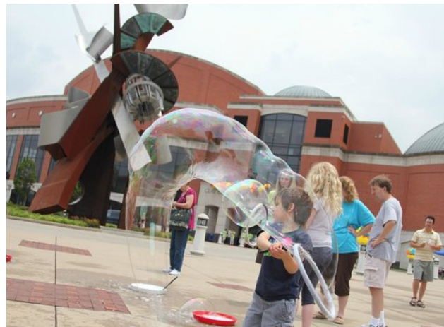
📍 Clay Center, Charleston, WV

The Clay Center: The 240,000-square-foot Clay Center for the Arts & Sciences of West Virginia opened on July 12, 2003. The Center houses the performing arts, visual arts and the sciences under one roof - one of only three centers of its kind in the country.