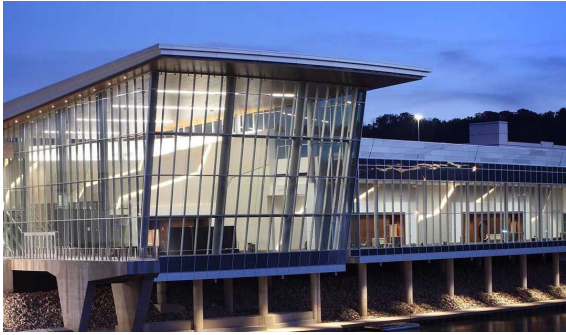
📍 Charleston Coliseum and Convention Center

The Charleston Coliseum and Convention Center: Formerly, "The Charleston Civic Center," this facility recently completed a $90 million renovation and expansion project, remaking itself into a more efficient, sustainable, dynamic and iconic best-in-class destination for concerts, conferences, business meetings and more.