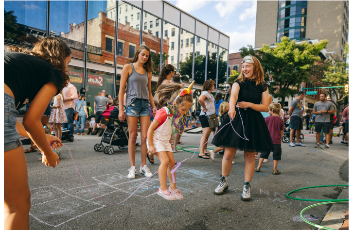
📍 Downtown Streetfest, Charleston, WV

Sports fan? Downtown is also home to the West Virginia Power, class-A affiliate of the Seattle Mariners.