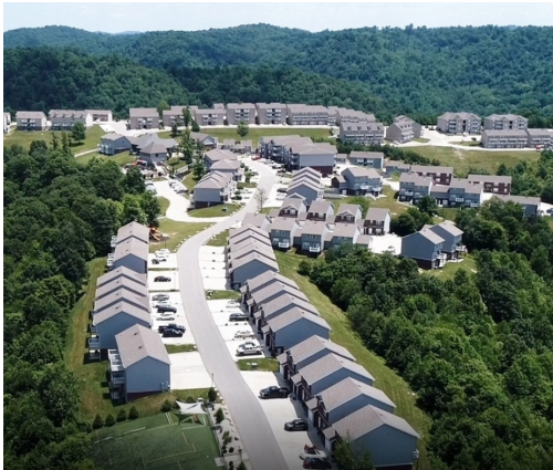
📍 Eagle View Apartments, Charleston, WV

New Developments: Less than 10 minutes from downtown Charleston sits Eagle View, a complex of apartments and luxury townhomes constructed in 2013. The complex features amenities such as two outdoor swimming pools and hot tubs, basketball and tennis courts, a gazebo grilling area with a fire pit, walking trails, a 24-hour fitness center and a dog park.